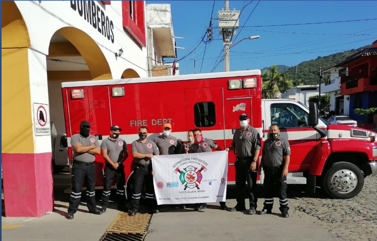
Ambulance donation from Santa Barbara to Puerto-Vallarta