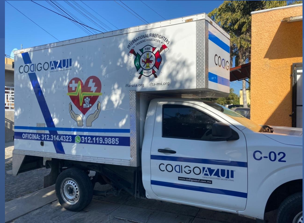
Emergency medical truck donation from IFTA to Colima