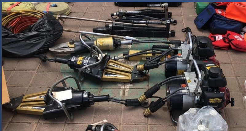
IFTA Fire Engine & Equipment Donation to Comala, Colima, Mexico