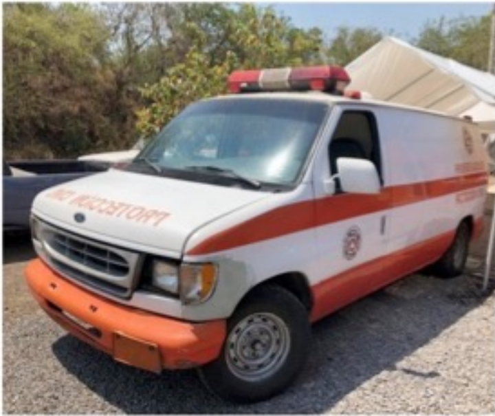
Comala, Mexico's old fire engine