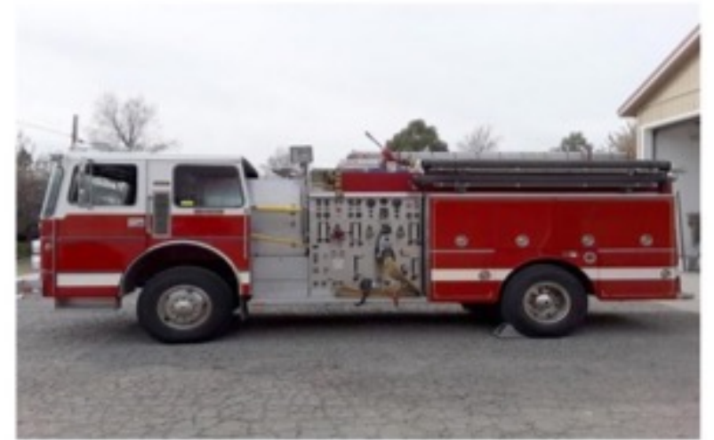
Comala, Mexico's new fire engine

Medical/CPR training to the Jalisco State Civil Protection Unit