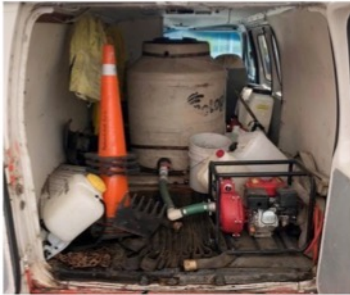
Comala, Mexico's old fire engine