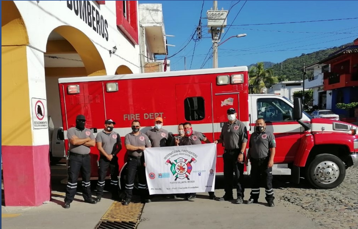
Ambulance donation from Santa Barbara to Puerto-Vallarta