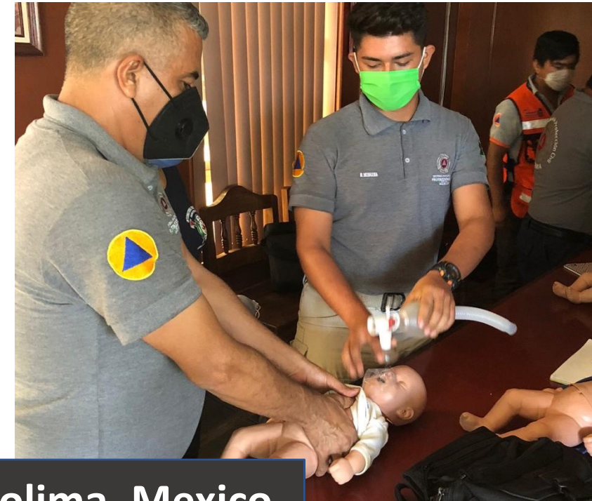
Emergency firefighting training in Comala, Colima, Mexico