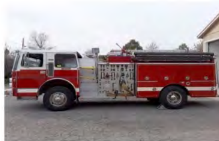
Comala, Mexico's new fire engine

Medical/CPR training to the Jalisco State Civil Protection Unit