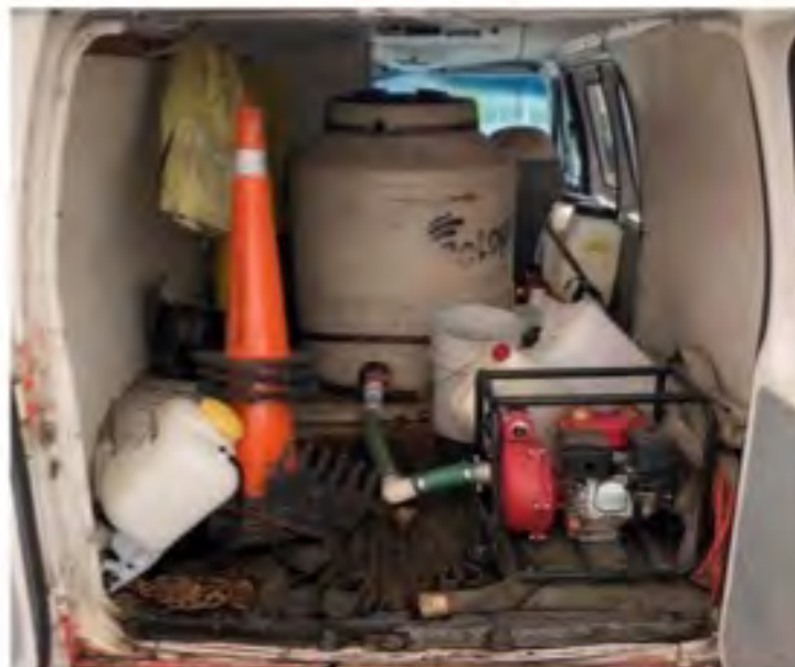
Comala, Mexico's old fire engine