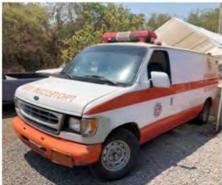
Comala, Mexico's old fire engine