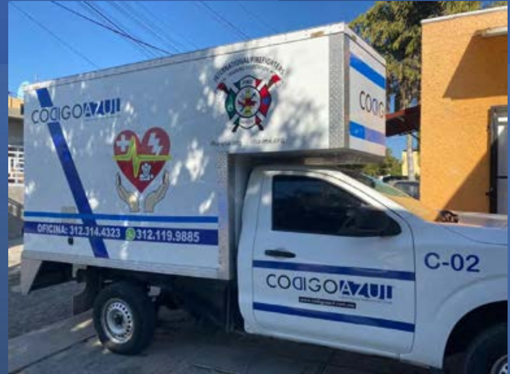
Emergency medical truck donation from IFTA to Colima