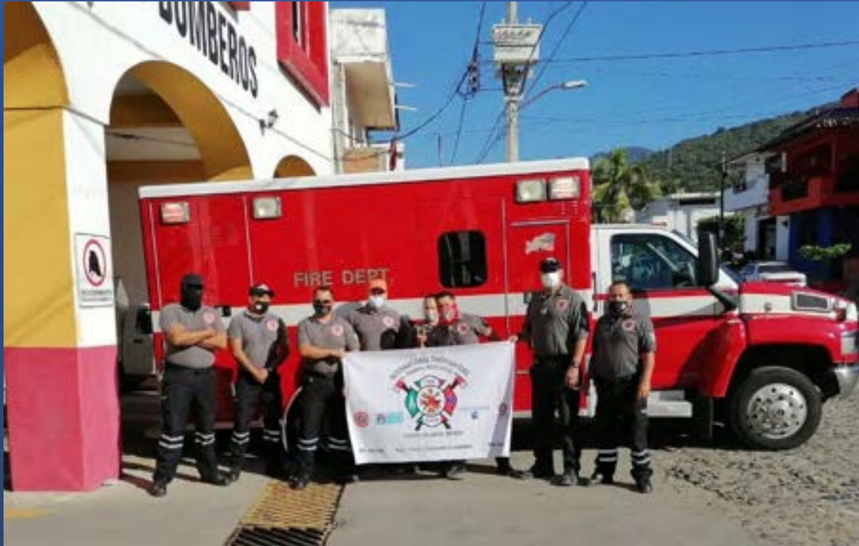
Ambulance donation from Santa Barbara to Puerto-Vallarta