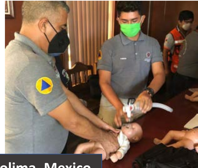
Emergency firefighting training in Comala, Colima, Mexico