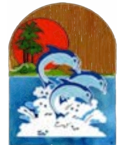
Santa Barbara-Puerto Vallarta Sister City Committee