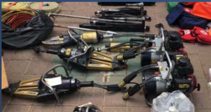
IFTA Fire Engine & Equipment Donation to Comala, Colima, Mexico